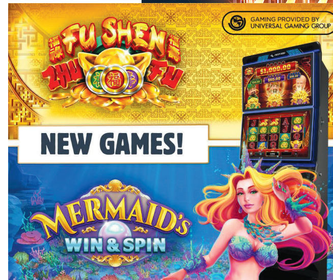
New Game Social Graphic